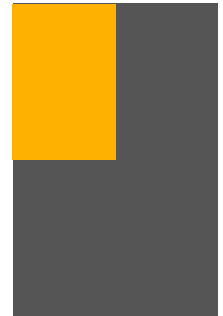
Quarter Page W 5.083" x L 7"