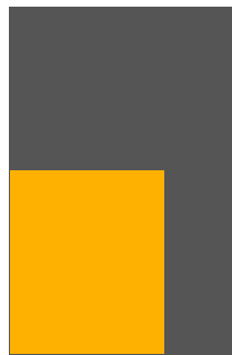
4 col x 7" W 6.833" x L 7"