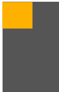
3 col x 4" W 5.083" x L 4"